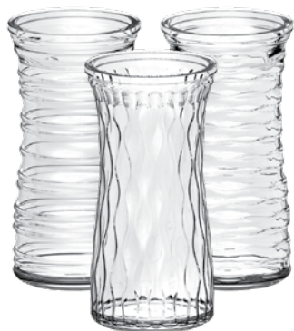
C973 9¾" Rose Vase Asst.